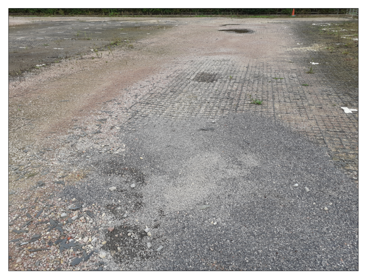
June 2020 – clean up begins ready for NHS test centre