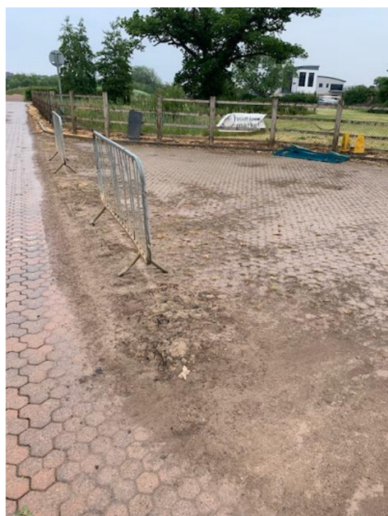
Surface mud on thrid exit of roundabout