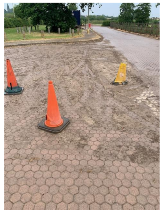
Surface mud on roundabout